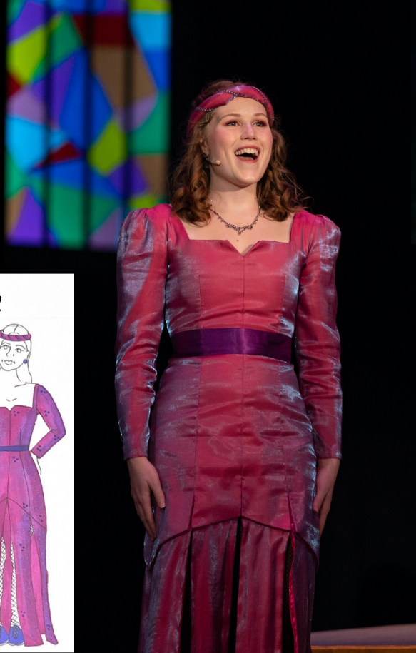
Head Over Heels- Philoclea